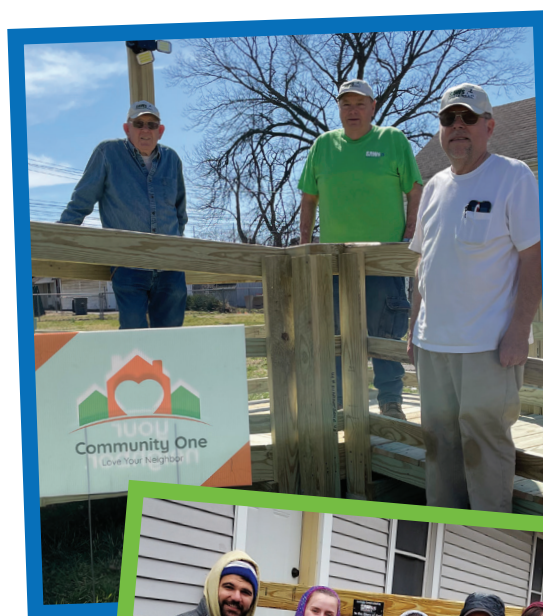
Community One partners with SAWs volunteers in Vanderburgh County