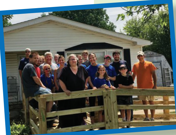
BraunAbility employees, SAWs volunteers, and our client after a successful ramp build

SAWs' fundraising campaign, #50in50, gives supporters the opportunity to help change a life and double their impact. BraunAbility has generously offered to match all donations up to $50,000 through May 13, 2022. Donate today to make sure your gift is eligible to make twice the difference in someone's life.