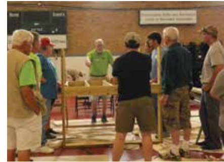
Monroe County volunteers attended a one-day training to learn about the SAWs building process