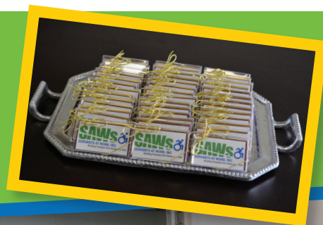
Preview Party guests received a chocolate bar with an edible SAWs logo.

On April 24, SAWs hosted its first Donor Preview Party to give those who provide the financial means for us to accomplish our mission the opportunity to have a sneak peak at our new office and warehouse. Guests enjoyed champagne and chocolate truffles as they were led on a tour of the new office, lingered for conversation and hors d'oeuvres in the warehouse and left with a chocolate bar featuring an edible SAWs logo.