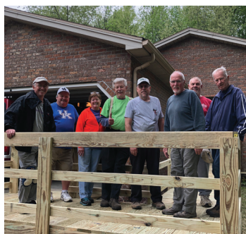
The Evansville crew smiles after completing their first ramp.

Evansville is the third largest city in Indiana by population. More than 23% of its citizens live at or below the poverty line and 7.8% of the 118,000 residents of Evansville or 9,204 people face ambulatory challenges.