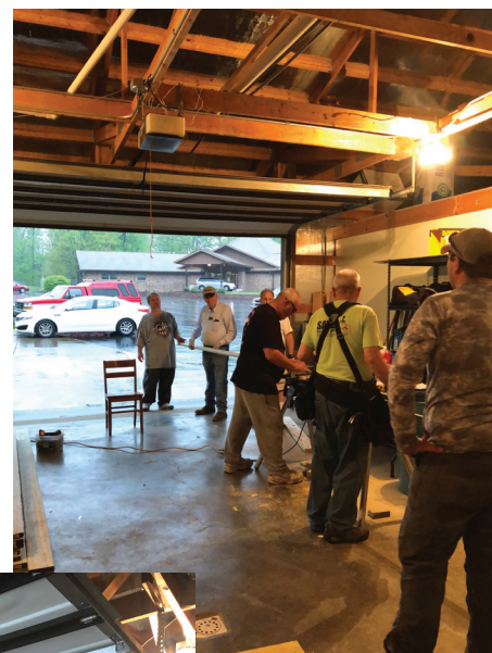
Prefabricating ramp parts on a rainy day highlights the importance of securing an indoor facility.