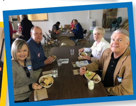
Volunteers socialize during our Cinco de Mayo themed Grand Opening.