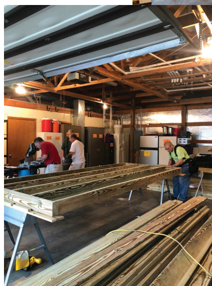
Volunteers work on pre-fabrication of platform and ramp frames.