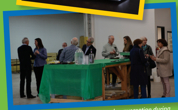
Donors enjoyed food, champagne and conversation during their preview of the newly renovated space.