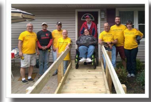
The new Boone County Construction Group completed a ramp for a client who is dependent on her chair and her mother. A